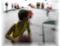
Putting skills into practice